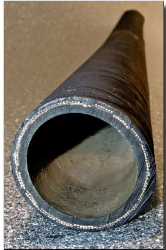
*Sold by 90cm Length

†Other part no. not included in the list are available. Please contact your sales representative if you have any questions.